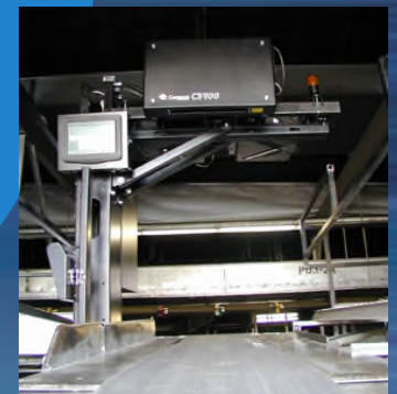
Optical & Laser