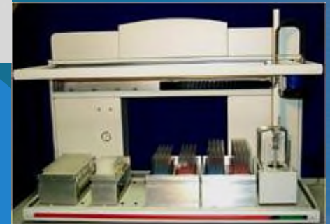
Automation & Robotics